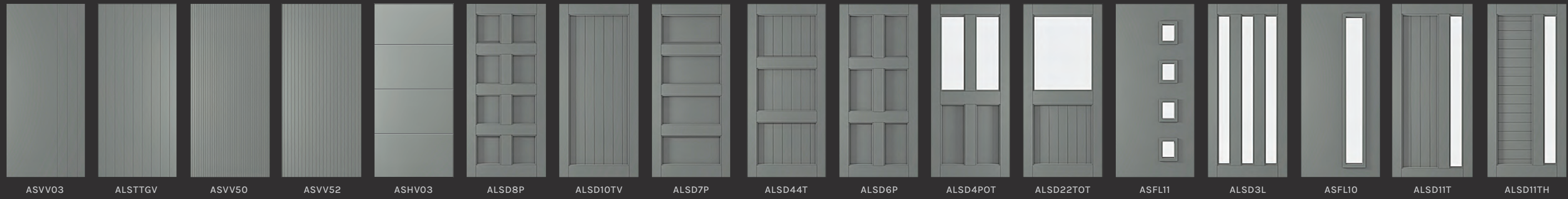
ASVV03 ALSTTGV ASVV50 ASVV52 ASHV03 ALSD8P ALSD10TV ALSD7P ALSD44T ALSD6P ALSD4POT ALSD22TOT ASFL11 ALSD3L ASFL10 ALSD11T ALSD11TH

SCAN THE QR CODE TO LEARN MORE AND EXPLORE OUR RANGE