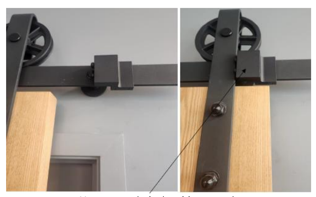
Move stop to desired position on track.