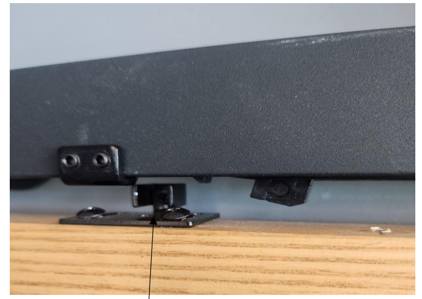
The connector can also be adjusted up or down by loosing the screw, its important that when you open the door, the soft closer doesn't go back to closed position, so that it stays at the open point ready to pick the connector up again when door closes. If this doesn't happen, you need to lift the connector up.