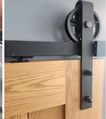
Slide in connector till flush with edge of door and fix in place two screws, the connector can go in or out to make sure it catches with the pick-up guide.