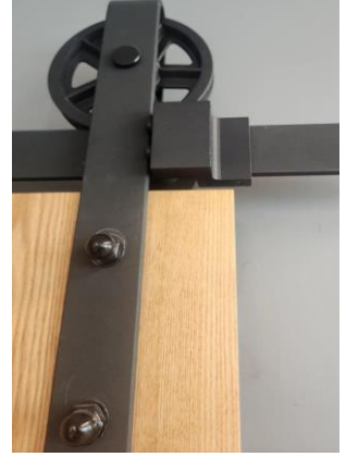
Bring door up to stop.