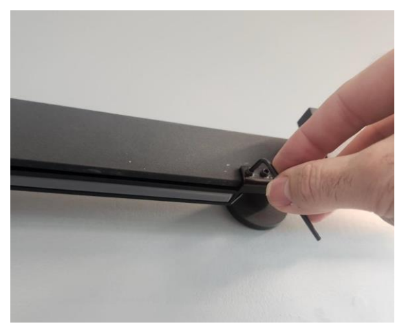
Push the soft closer on to the bottom of the track and fix in place the clamp, put closer as close as possible towards stop.